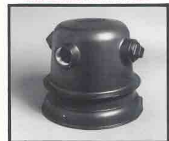
CAST ALUMINUM HOUSING

This document contains proprietary information of the Sequoia Lighting Corp. and is transmitted in confidence. Any reproduction, disclosure, or use of this document is expressly prohibited except as Sequoia Lighting Corp. may otherwise agree in writing. COPYRIGHT 1993 © SEQUOIA LIGHTING CORPORATION.