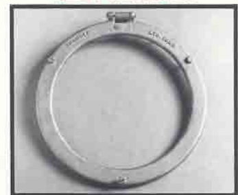
BRASS RING WITH HINGE