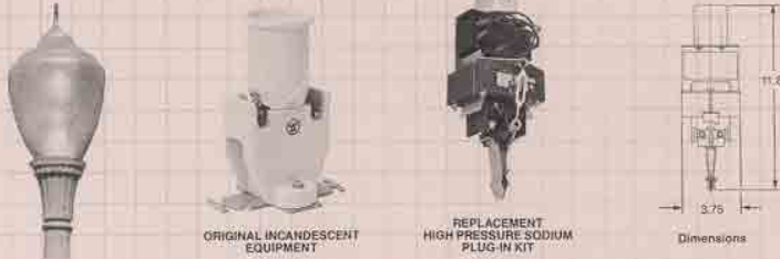
ORIGINAL INCANDESCENT EQUIPMENT