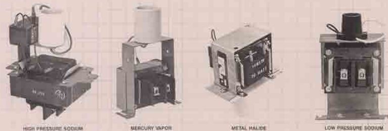
HIGH PRESSURE SODIUM

pressure sodium, mercury vapor, metal halide and low pressure sodium. Contact factory for details on how to order custom kits.