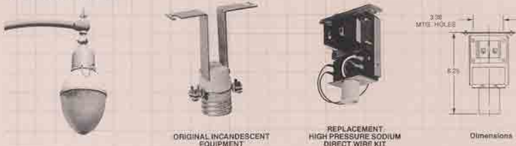
ORIGINAL INCANDESCENT EQUIPMENT