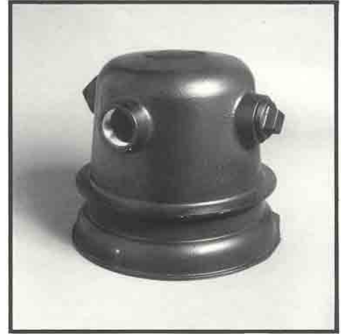
SOFFIT LUMINAIRE HOUSING *CALTRANS APPROVED