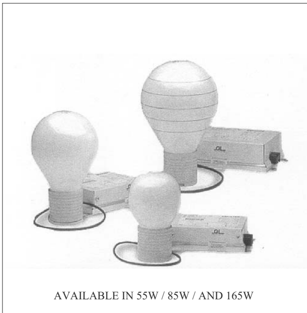
AVAILABLE IN 55W / 85W / AND 165W